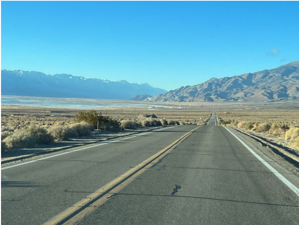
CA136 Northwest Back to Lone Pine

KEELER END OF THE LINE FROM MOUND HOUSE, NEVADA, NARROW GAUGE RAILS OF THE CARSON & COLORADO RAILROAD REACHED THIS SITE IN 1895. CERRO GORDO AND OTHER MINES FALTERED, THE RAIL LINE FELL ON HARD TIMES, SO PLANS TO EXTEND THE LINE TO MOJAVE WERE ABANDONED, LEAVING KEELER AS "END OF THE LINE". DEDICATED MAY 13, 1975 SLIM PRINCESS CHAPTER E CLAMPUS VITUS INYO COUNTY BOARD OF SUPERVISORS