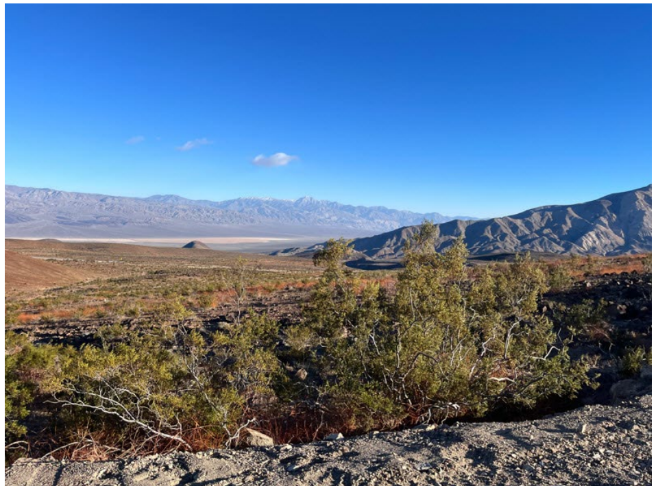
Entering Death Valley from the West on CA190

More than once an enormous moon was at eye level straight ahead not helping as I was navigating the turn. The views over the edge into the valley imprinted my mind as well. That was one of those times where there was no way to stop and take a picture but this time I could and I did.