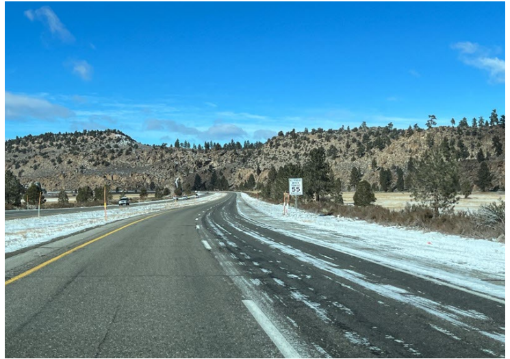
Getting icy near Convict Lake

In Lone Pine we saw a sprinkler by the road that came on every few minutes. In the cold it was creating icicle stalactites on the tree and stalagmites in the grass. Since we stopped there, we could read all about the old Live Oak tree that started as a clipping from a tree in Sherwood Forest with Robin Hood.