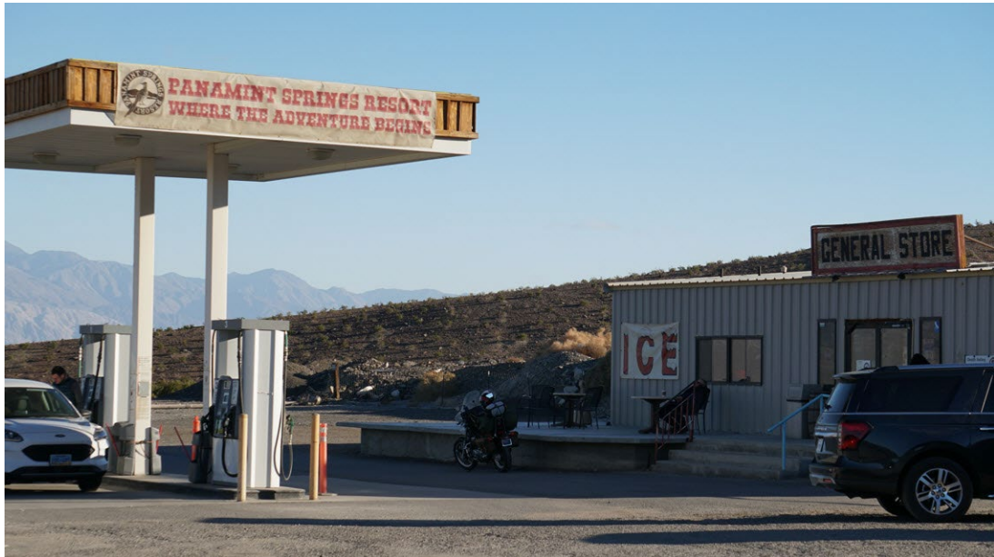
CA190 Panamint Springs