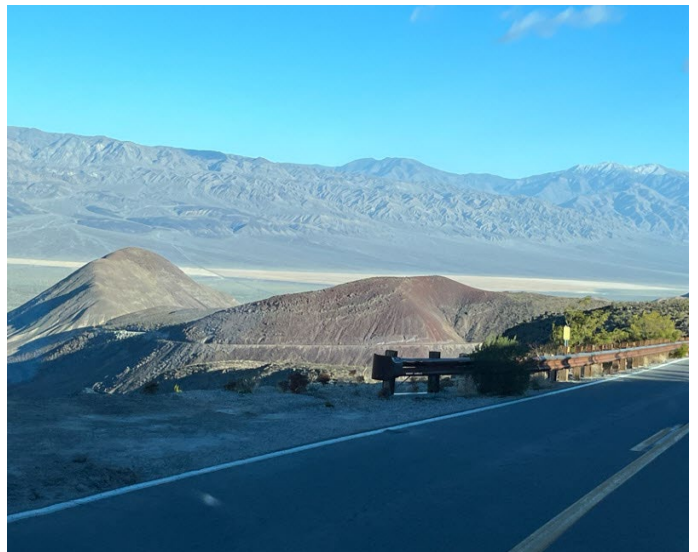
CA190 Just Past Padre Crowley Overlook toward Death Valley