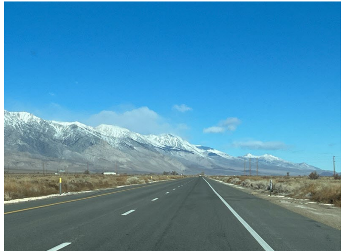
North To Lone Pine

I took some pictures of the changing scenery throughout the drive in early January this year. Fortunately, a friend of mine did most of the driving. I relished the views that reminded me what I liked about 395 in prior travels and what I was trying to remember about CA190.