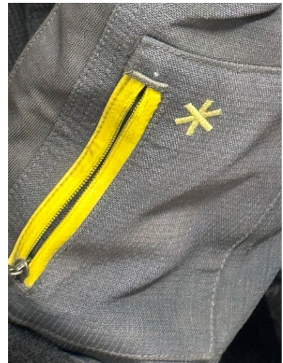
Special Pocket on Klim Jacket

Motorcycle clothing manufacturers have tried to address this question by creating pockets in the arms of their jackets to store medical information. In the case of KLIM jackets there is a pocket with a SYMBOL readily identifying the pocket. I would say MOST people do not take advantage of these pockets, don't know what they're for or don't keep current information in them. But my really cool summer jacket which I've had for years does not have these pockets. Not all style of gear has these pockets.