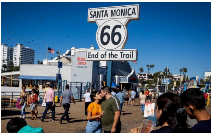
Mother Road Adventure Start or Finish, western leg

We hope you will find time to complete a couple of our tours over the riding season. We also hope you will introduce your friends who have not ridden one of our tours to what we have available. I've heard many times from new riders, "I wish I would have heard about the SCMA rides earlier, they are so much fun."