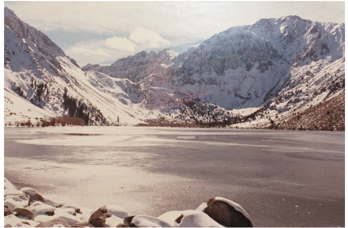
Convict Lake Near Mammoth Lakes, California

I wanted to make a short road trip after surviving the holidays this year. Sometime in 2023, I ran across this framed enlargement I shot at Convict Lake in the Sierras near Mammoth Lakes, California on Highway 395 – part of the path of the 2024 Three Flags Classic. This first picture was shot when returning from a Mammoth Mountain ski trip in the early 1980s. Convict Lake is one of the many unique places along 395. I thought it might be fun to take a few days and run up 395 to Bishop, maybe to Convict Lake and one other place. I wanted to find the magical and very twisty section of road leading into Death Valley that I had ridden at dusk during the Red Hot Riders' Baby Butt 1000-mile event in 2002. I was pretty sure it was CA190 out of Lone Pine, California, also on 395.