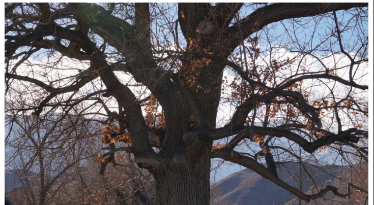
Lone Pine – English Pendunculate Oak Tree from Sherwood Forest England-Land of Robin Hood