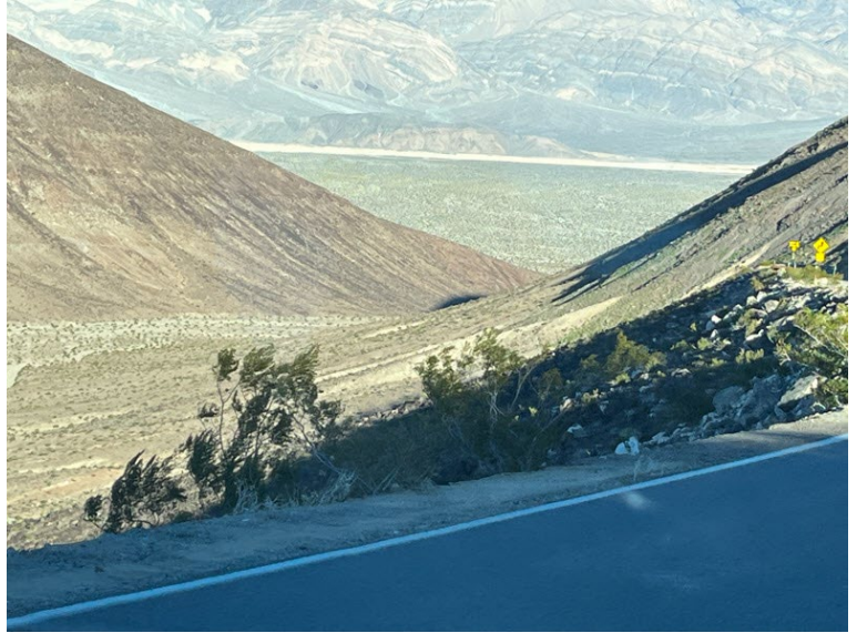
CA190 Past Padre Crowley Overlook toward Death Valley