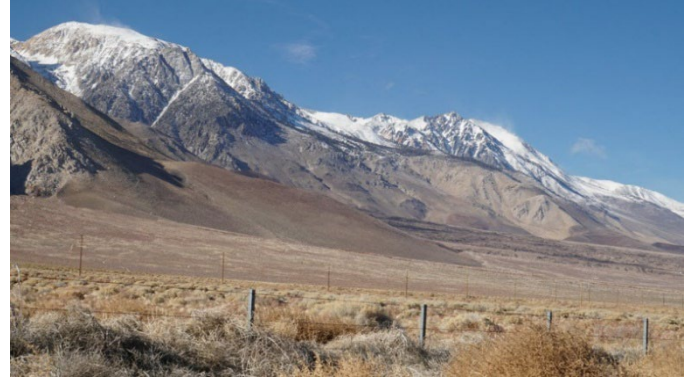
Peaks Near Lone Pine

It was time to see what we could see en route to Death Valley via CA190. From Lone Pine you can go southeast on CA136 to meet up with CA190 and continue down to Panamint Springs and beyond.