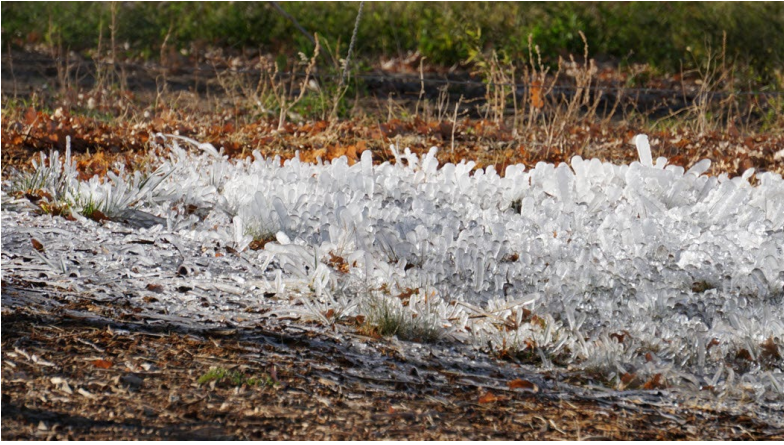
Grass Stalagmites – Lone Pine