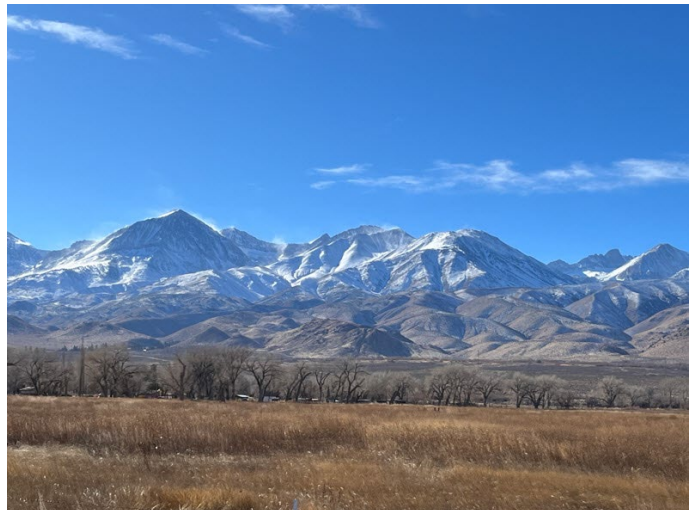
Layers - South to Lone Pine from Bishop

On weekend ski trips to Mammoth Mountain in the 80's, we usually drove at night, sometimes very late into the night. When I could go for longer ski trips I enjoyed driving up and back during the day when I could see it all. I had almost forgotten how dramatic and beautiful each section of the road is all the way up to Bishop, and how it changes during the day. The Sierra range runs mostly north and south so there is shade in the afternoon to the west and the colors change during the day.