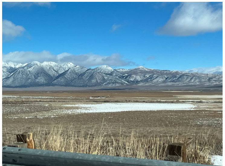
South Toward Crowley Lake