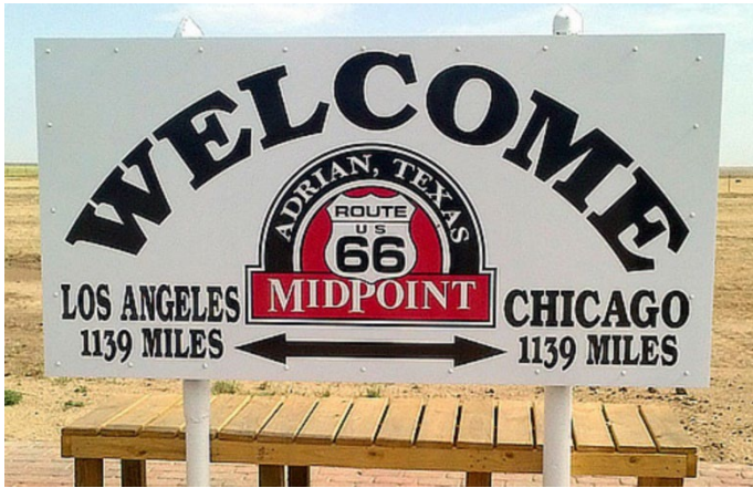
Mother Road Adventure Start or Finish, eastern leg or western leg