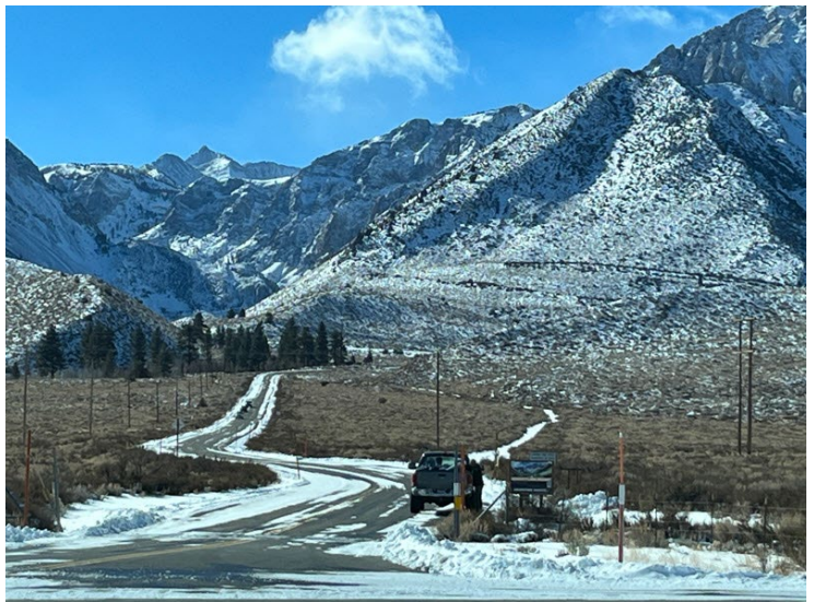
Icy Entrance to Convict Lake