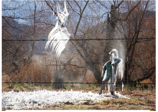
Tree Stalactites – Sprinkler in Lone Pine